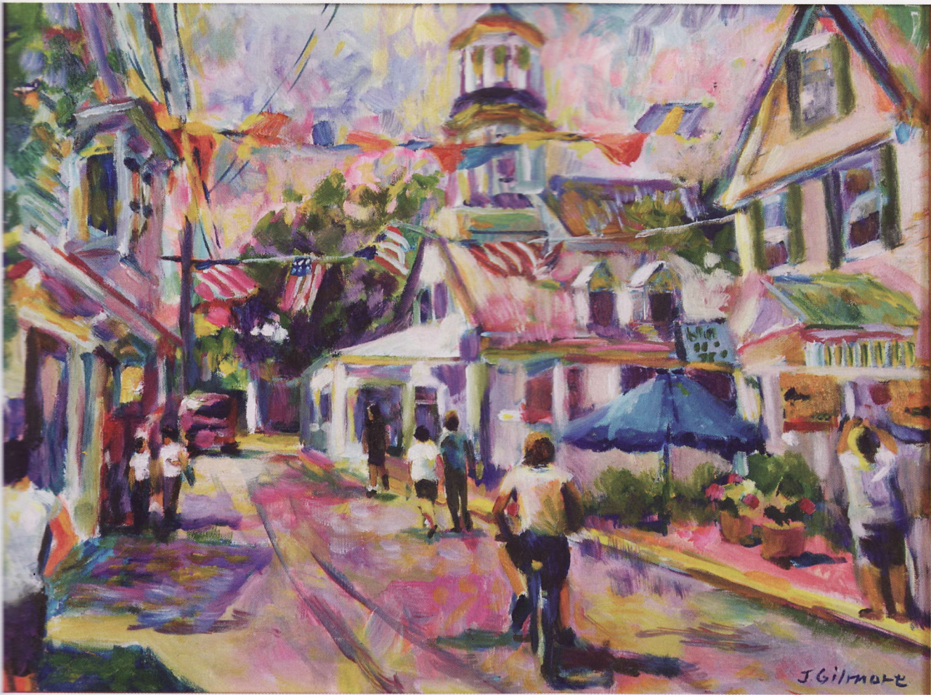
Provincetown , oil on canvas, 16" x 20"

trians maneuvering down Commercial Street; or Valentine's Day , a 16" x 20" oil painting featuring a lush setting of roses, a heart-shaped candy box, and a glass of red wine.